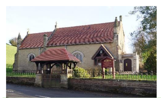
A 'Chapel of Ease' in the Parish of Warton, providing a place of worship for the villagers of Borwick and Priest Hutton.